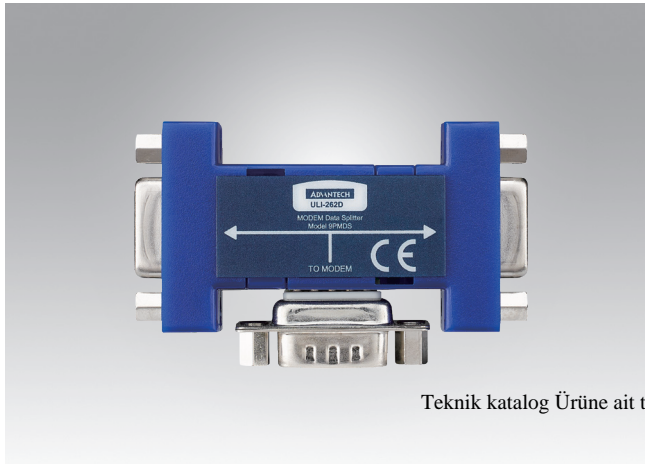
Teknik katalog Ürüne ait teknik katalog için tıklayın