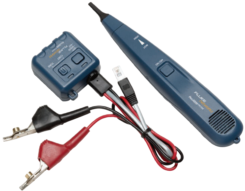
Pro3000 Toner and Probe

Use the SmartTone capability of the Pro3000 Tone Generator to identify the right pair. When touching the wires together and momentarily shorting the far end of a cable pair, the SmartTone technology will change the cadence of the tone generated. This tone change you hear through the probe positively verifies the correct wire pair. SmartTone provides five distinct tones for exact pair identification.