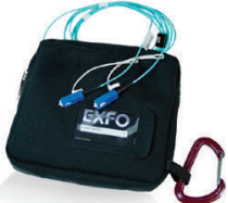
EF launch fiber (SPSB-EF-C30)

Whether for expanding enterprise-class businesses or large-volume data centers, new high-speed data networks built with multimode fibers are running under tighter tolerances than ever before. In the event of failure, intelligent and accurate test tools are needed to quickly find and fix the fault.